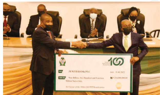
Mr. Godwin Emefiele presenting a symbolic cheque to one of the participating Financial Institutions

He explained that, under the initiative, every hundred days, manufacturers in critical sectors that seek to engage in greenfield projects or in expanding their existing facilities will have access to cheaper forms of credit at single digit rates, as well as foreign exchange to procure plants and machineries.