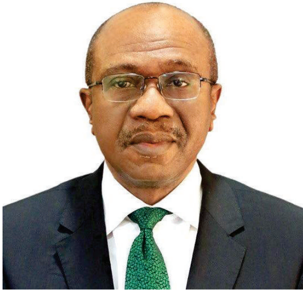
Mr. Godwin Emefiele Governor, Central Bank of Nigeria

materials could be sourced within the country was intended to increase industrial production and preserve foreign exchange. Mr. Emefiele said the decision had helped to boost the production capacity of cement in the country.