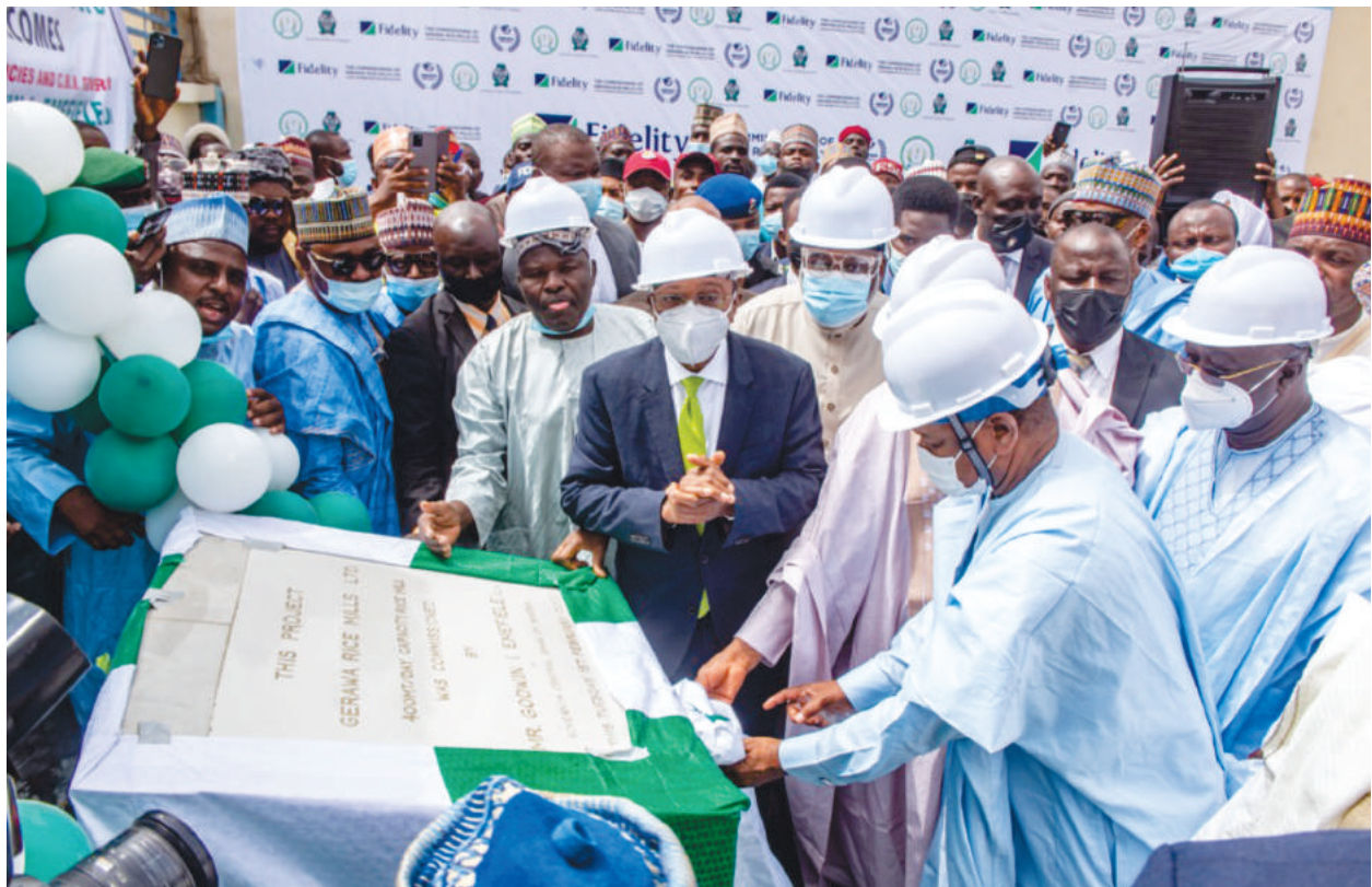
CBN Governor, Mr. Godwin Emefiele inaugurating the Garewa Rice Mill accompanied by other dignitaries

T he Governor, Central Bank of Nigeria (CBN), Mr. Godwin Emefiele, has urged rice mills in the country to embrace the Bank's backward integration initiative aimed at conserving foreign exchange reserves, revamping local production capacity and creating employment.