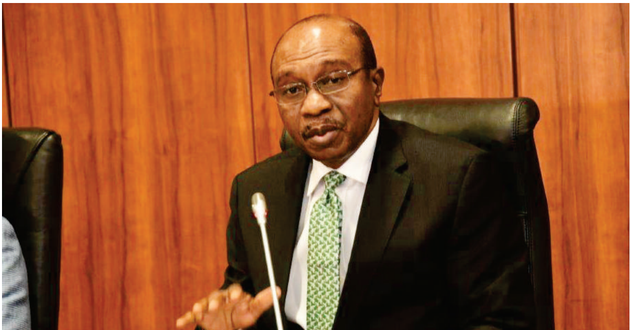
Mr. Godwin Emefiele Governor, Central Bank of Nigeria

T he Governor of the Central Bank of Nigeria (CBN), Mr. Godwin Emefiele, has expressed commitment to tackling the economic challenges facing Nigeria's economy.