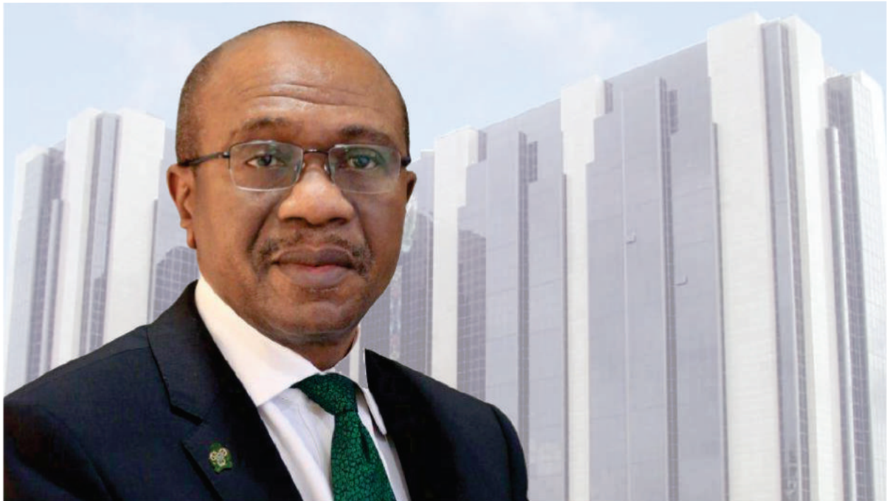
Mr. Godwin Emefiele Governor, Central Bank of Nigeria