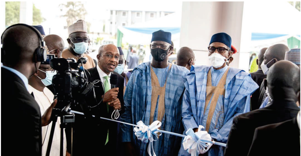
CBN Governor, Mr. Godwin Emefiele presenting the new CBN Lafia Branch building to President Muhammadu Buhari for the inauguration ceremony as the Nassarawa State Governor, Engr. Abdullahi Sule looks on

Furthermore, he said the new complex, which would